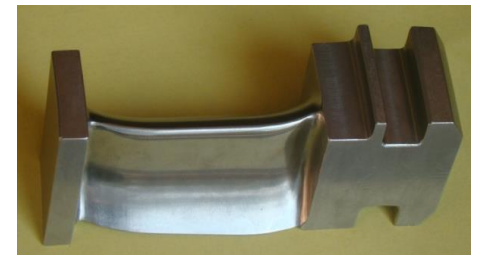
500 MW first stage ODS steel blade